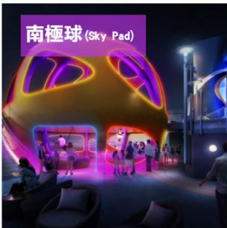
南極球 (Sky Pad)