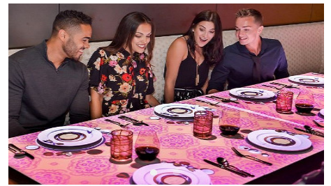
Le Petit Chef®